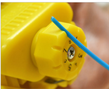
Built-in sizing channels determine proper setting for buffer tubes.