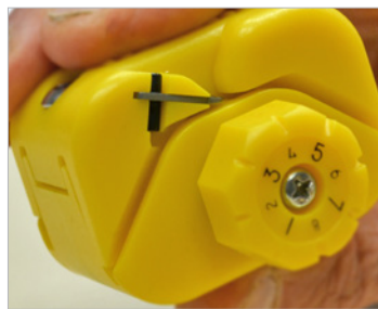
Spring-loaded design eliminates need to lock or clamp tool while in use.