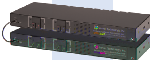
Rear View: linking input