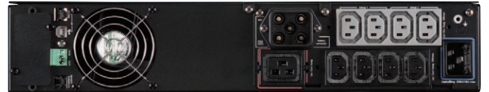
5PX from 1500VA to 3000VA.