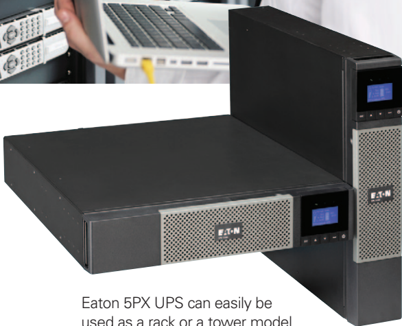
Eaton 5PX UPS can easily be used as a rack or a tower model.